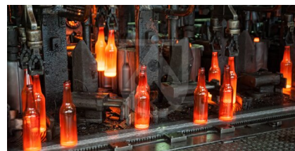
Gripper for glass bottles