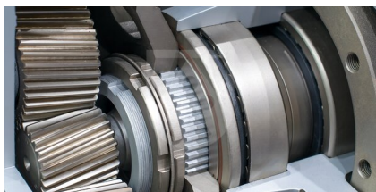
Thrust washer for electric cars